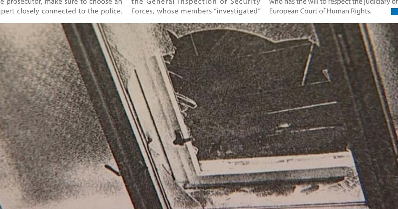
A photography from the investigation records

It is also fundamental to omit to secure some of the proofs, such as reconstruction of the crime, expert opinions, or securing and examining clothes of the victim. When it is unavoidable to request an expert opinion, after the complaints from the prosecutor, make sure to choose an expert closely connected to the police.